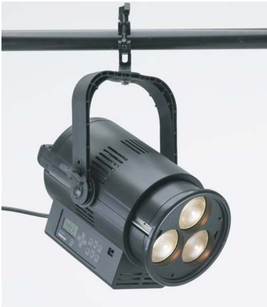
PL3 LED Luminaire

Drawing on technology and specific insight, nurtured and developed, within the Philips Entertainment group the PL3 meets the everyday challenges of illuminating the world’s stages and studios. A lighting instrument that extends the creative possibilities with light while significantly reducing the impact of our activities on the environment.