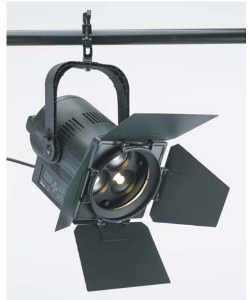
PL3 LED Luminaire shown with Barndoor Option

The PL3 LED luminaire extends the creative opportunities of lighting design to tell a story, command attention, and direct emotion.