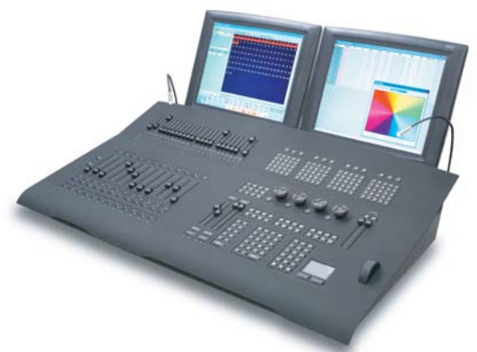
Strand Lighting Light Palette VL