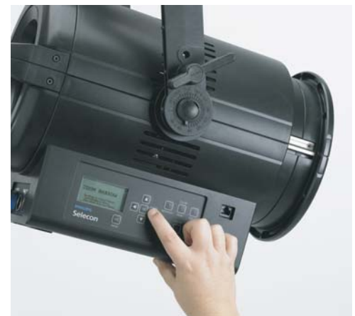
PL3 Luminaire Advanced Control

All PL3 luminaires support wired and wireless DMX control with a choice of 8 or 16 bit control resolution. With the increased development of LED luminaires like PL1 and PL3 with 4 or more colors additional control is needed for intuitive operation. All Palette family controls now support extended color control and color temperature control to simplify programming and luminaire color matching.