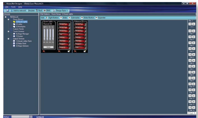
Vision.net Designer set-up screen