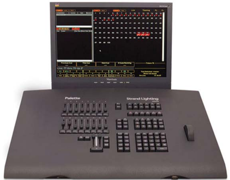
basicPalettell Lighting Control Console

Clean, elegant, and very, very powerful, basic Palette is a thoroughbred. Starting with 100 channels, a single playback and 16 submasters, basicPalettell will allow you to program complex shows, easily – elegantly.