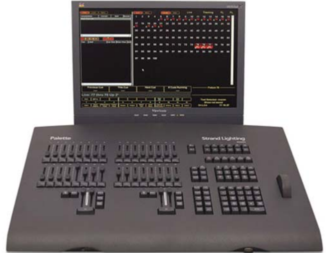
classicPalettell Lighting Control Console

Clean, elegant, and very, very powerful, classic Palette II is a thoroughbred. Starting at 150 channels, classic Palette II can be expanded to 3,000 channels. And with two playbacks and 32 submasters, classic Palette II will eat up complex shows, easily – elegantly.