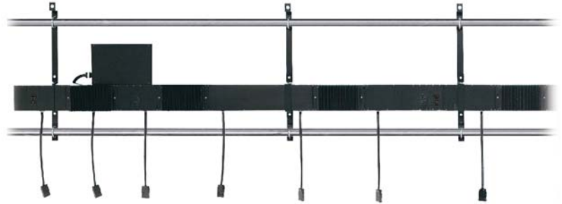
R21 Powered Raceway Distributed Dimming System

R21 Powered Raceway from Strand Lighting is a perfect extension of our C21 and A21 range of installed dimmer cabinets. Systems can be mixed and matched as needed to create a completely flexible lighting system to meet the needs of any installation. Our powered raceway features quiet convection cooled IGBT dimming for low lamp noise and reliable operation.